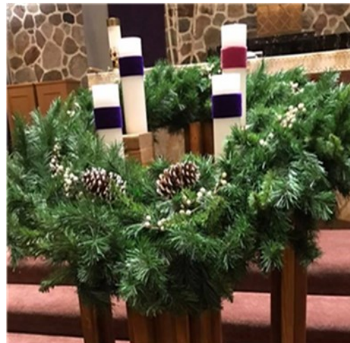
The four candles of the Advent wreath represent Hope, Peace, Love, and Joy